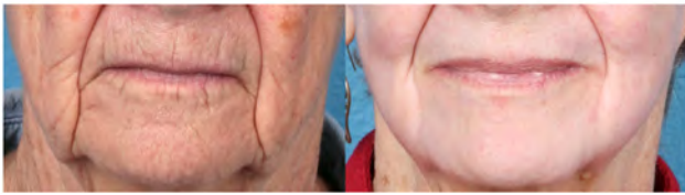
FIGURE 4 A, Full-face helium plasma dermal resurfacing. B, Perioral close-up. Left, before treatment. Right, 6 months after prophylactic lower eyelid lateral canthoplasty and full-face helium plasma dermal resurfacing. Treatment parameters for first pass included full-face treatment to mandibular line inferiorly with 50% power, 4 L/min helium gas flow, and 60 ms on and 20 ms off pulsing. After wiping away desiccated surface tissue, a second pass (50% power, 4 L/min helium gas flow, and 80 ms on and 20 ms off pulsing) was made over the cheeks and perioral areas. Notice (1) improvement of dyschromia over forehead, cheeks, and nose; (2) improvement of lip lines; and (3) significant skin tissue contraction and remodeling over cheeks and perioral area as well as along jawline