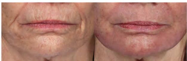
FIGURE 3 A, Full-face helium plasma dermal resurfacing. B, Perioral close-up. Left, before treatment. Right, 6 weeks after full-face helium plasma dermal resurfacing. Treatment parameters for first pass included full-face treatment at 20% power, 4 L/min helium gas flow, and 20 ms on and 20 ms off pulsing. After wiping away desiccated surface tissue, a second pass (40% power, 4 L/min helium flow, and 20 ms on and 20 ms off pulsing) was made over the glabella, upper eyelids, and perioral areas. Notice (1) improvement of medial brow position with greater visibility of upper eyelids; (2) improvement of lip lines and perioral folds; (3) continuing erythema of areas where the skin is thin and/or a second pass was made; and (4) residual focal dyschromia in the cheek areas where treatment depth was limited by a single treatment pass

areas with superficial dry crusts. Wounds that remain open and moist may benefit from allograft or xenograft (eg, Cytal Wound Matrix 1-Layer; ACell, Columbia, MD) sheets. Telangiectasias may appear with robust neovascularization during the inflammatory phase of wound healing. Telangiectasias generally respond well to treatment with lasers of appropriate wavelengths.