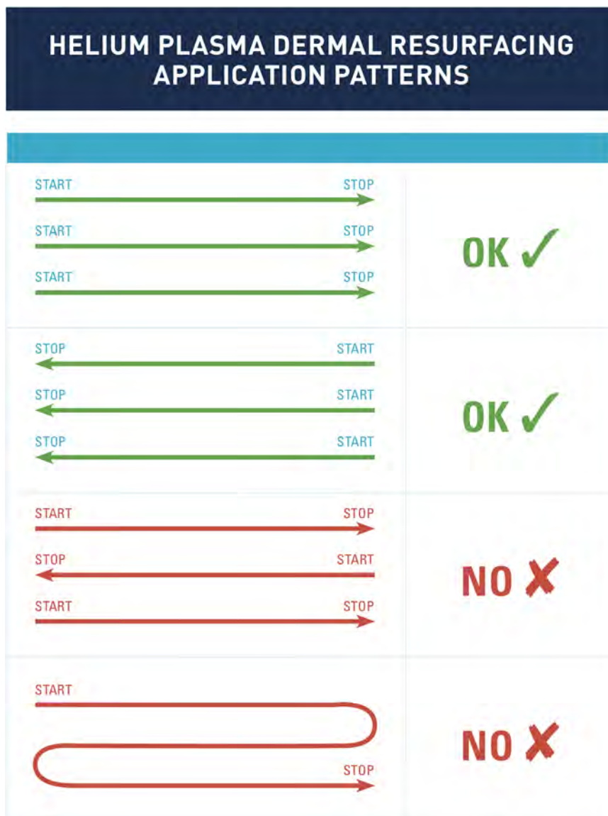
FIGURE 2 Proper helium plasma application pattern. Examples of proper (green lines) and improper (red lines) helium plasma dermal resurfacing energy application patterns. Following these guidelines is suggested to avoid the potential for undesirable increases in energy density at the ends of treatment rows

The consensus panel recommends linear nonoverlapping unidirectional treatment passes (Figure 2) with appropriate treatment parameters and tip velocity to result in even coagulation of superficial skin layers and a uniform white frosted appearance after the initial pass. Desiccated tissue