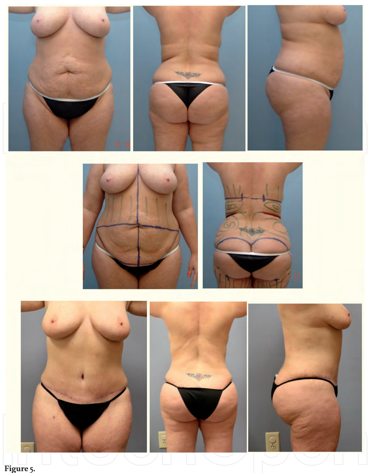
Preoperative photographs demonstrating skin excess and abdominal striae. Postoperative result at 6 months with improved contour.

Contour irregularities may be treated with manual lymphatic drainage (MLD) or Endermologie when mild. Endermologie and MLD help reduce postoperative edema and soften areas of firmness. More significant irregularities may be addressed with Kybella or touch up liposuction.