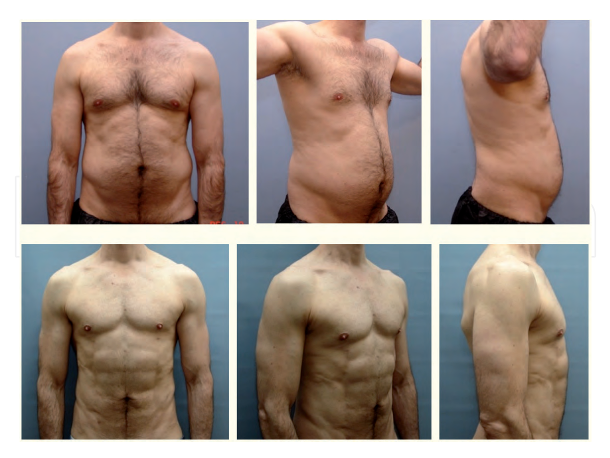
Figure 6. Preoperative photographs and 3 month postoperative photographs are shown.