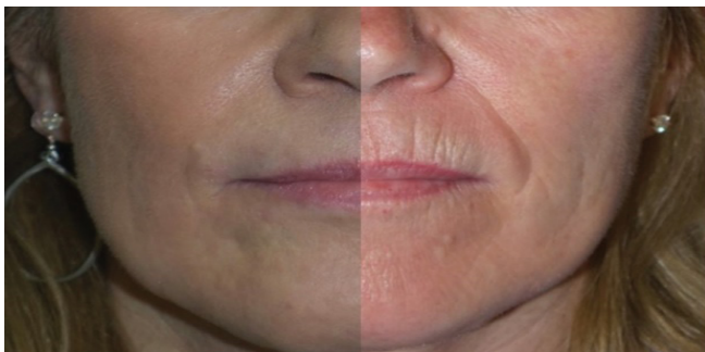
Figure 3 Patient #2, side by side comparison of 18 months after treatment (left) and before (right).

lactate) and low aspiration pressure (13-14 mmHg). One half of the harvested fat, approximately 50 cc, was processed with collagenase to obtain a cellular stromal vascular fraction (cSVF) to enrich fat grafts. The cSVF and high density (4-5X) PRP were combined with 60cc of structural fat grafts for panfacial volume augmentation. Approximately 20 cc of PRP-enriched nanofat (Nanotransfer™ Generation I) stem cell enrichment was injected intradermally to perioral area, forehead, lateral eyelids, and